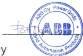
ABB Oy Power Grids Vaasa, Finland